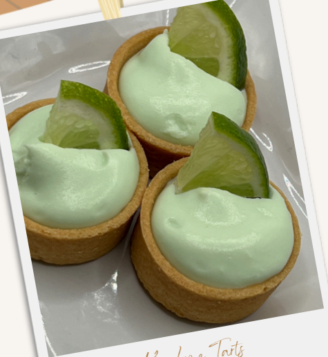
Key Lime Tarts