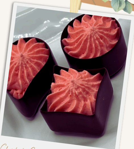
Chocolate Cups with Raspberry Mousse

(All full size desserts are priced separately $5 each)