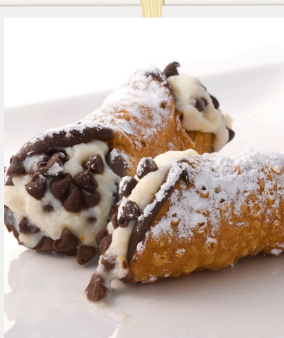
Mini Chocolate Chip Cannolis